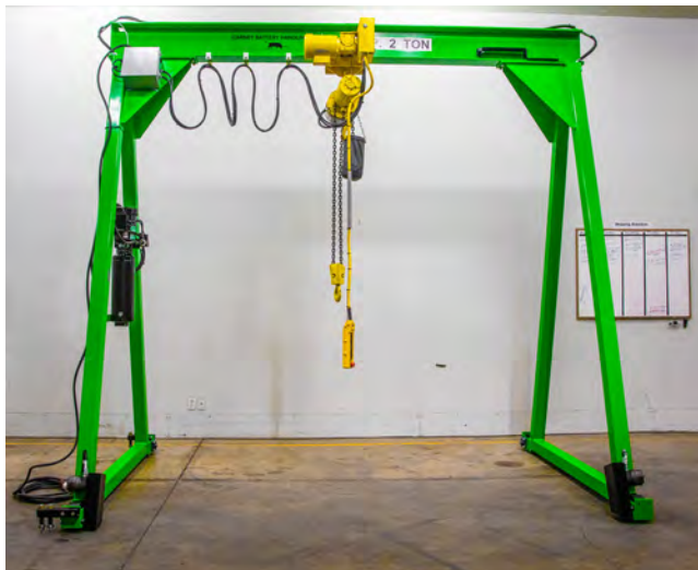
Gantry crane full front view with hoist