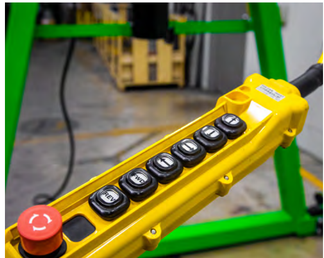
Gantry crane hoist controller