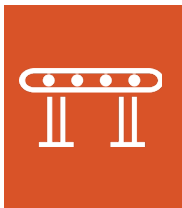
Automated Material Handling Systems