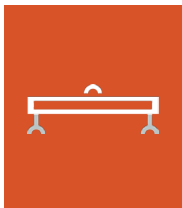
Below-the- Hook Lifting Devices