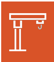
Cranes and Crane Systems